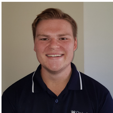
DAV FRANCIS LAKE WYANGAN